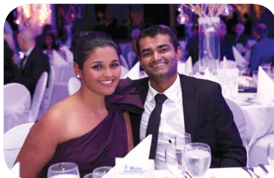
> Above: GPs and their guests enjoying the Winter Wonderland Gala Dinner.